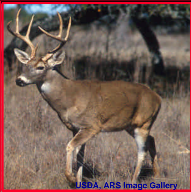
USDA, ARS Image Gallery

Anthrax ♦ Brucellosis ♦ Tularemia ♦ Plague ♦ Q-Fever Crimean-Congo Hemorrhagic fever ♦ Eastern/Venezuelan Equine Encephalitis ♦ Rift Valley fever