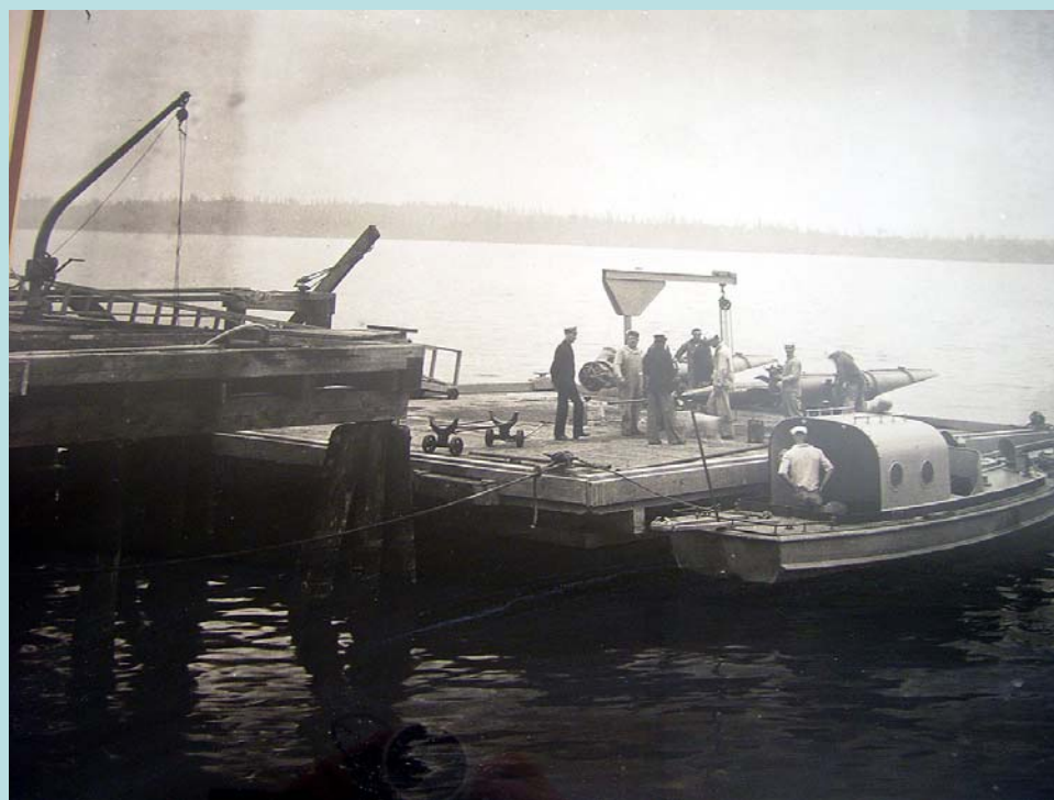
Early T&E at Keyport