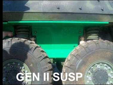
GEN II SUSP