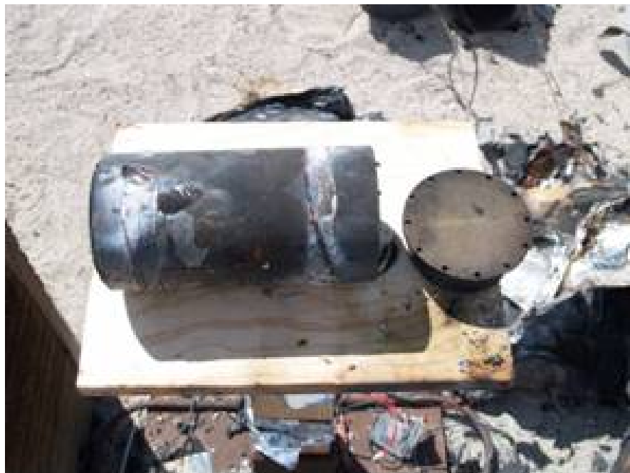
Main body and end closure

No damage to main body, end closure, or copper liner