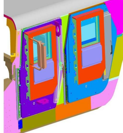
Armor Coupon Shots – 48-hr Response to Theater