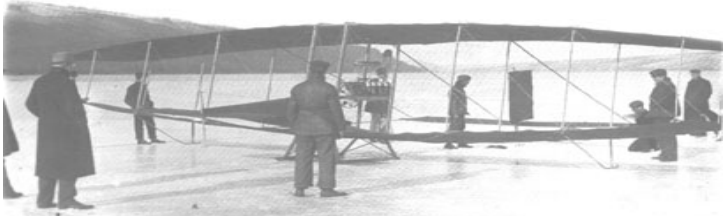
1909 Aeronautical Division, Office of the Chief Signal Office, US Army