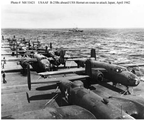
Photo # NH 53421 USAAF B-25Bs aboard USS Hornet en route to attack Japan, April 1942