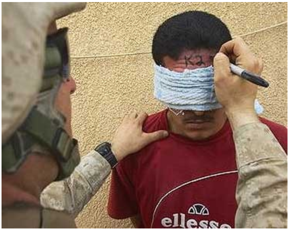
2003 Operations in Iraq