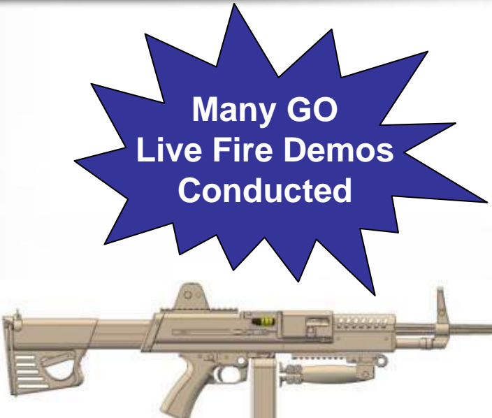
Lightweight Machine Gun Concept