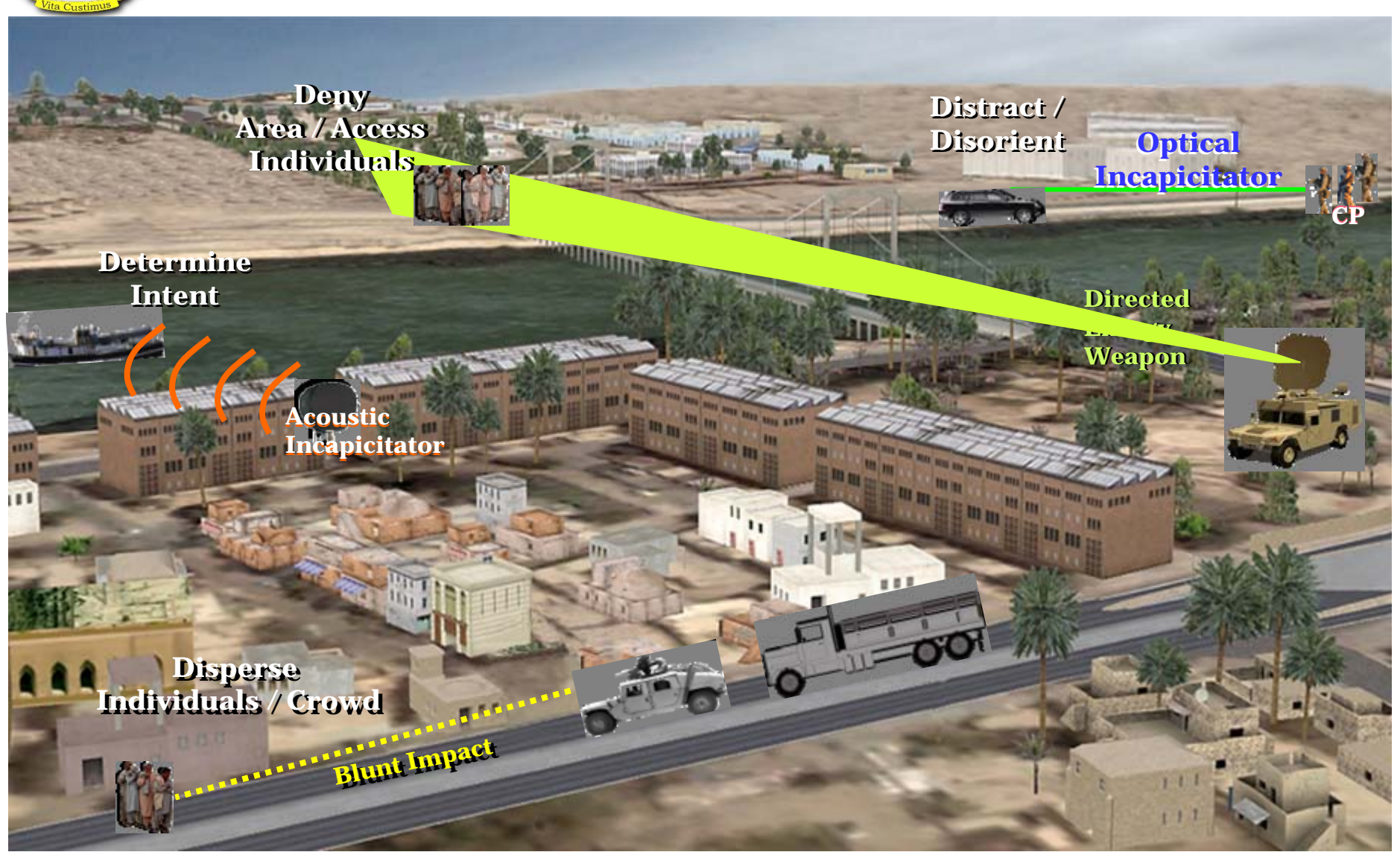
Distribution Statement A – Approved for Public Release