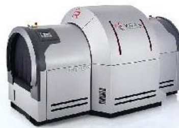
CT-80 X-Ray Security Screening System

The CT-80 utilizes Reveal's proprietary Dual Energy, Computed Tomography (CT) architecture. This is a unique approach to EDS design that enables full size checked baggage to be inspected in the smallest possible footprint. The Reveal CT-80's superior detection and false alarm performance is available for as little as one quarter the cost of traditional certified CT scanners.