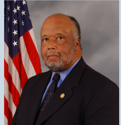
KEYNOTE ADDRESS CONGRESSMAN BENNIE THOMPSON (D-MS) CHAIRMAN, COMMITTEE ON HOMELAND SECURITY, U.S. HOUSE OF REPRESENTATIVES