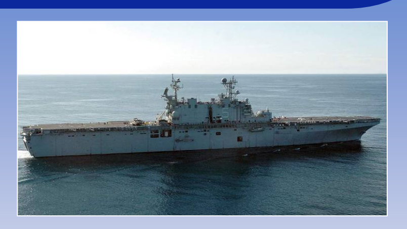
USS Boxer Central and South America – Pacific: May-June