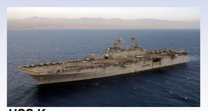
USS Kearsarge Central and South America – Atlantic: August-November