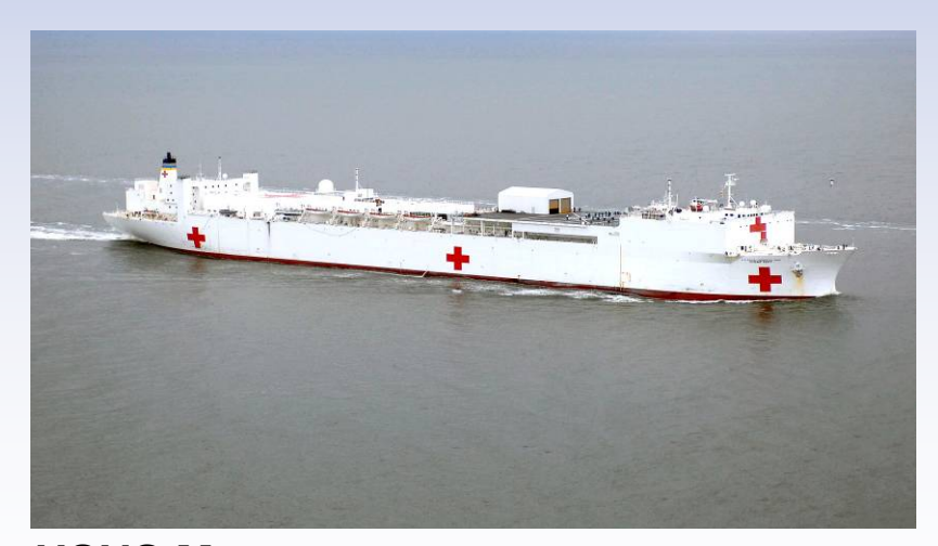
USNS Mercy Southeast Asia: June-September