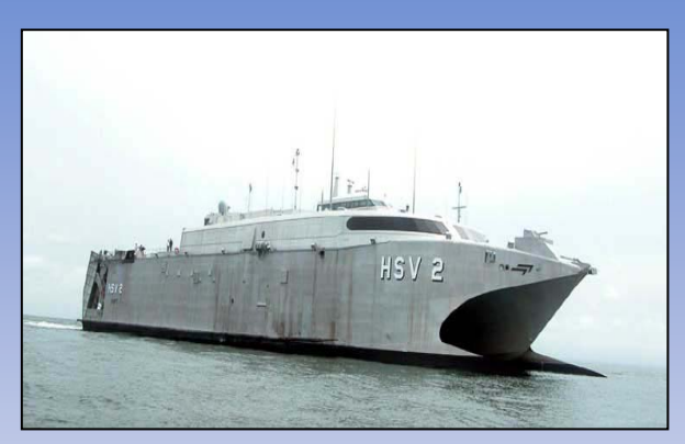
HMS SWIFT West Africa: March-May