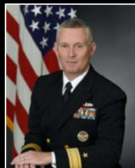
Commander RDML, USN