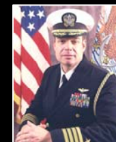
Chief of Staff CAPT, USN