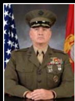
Deputy Commander Col, USMC