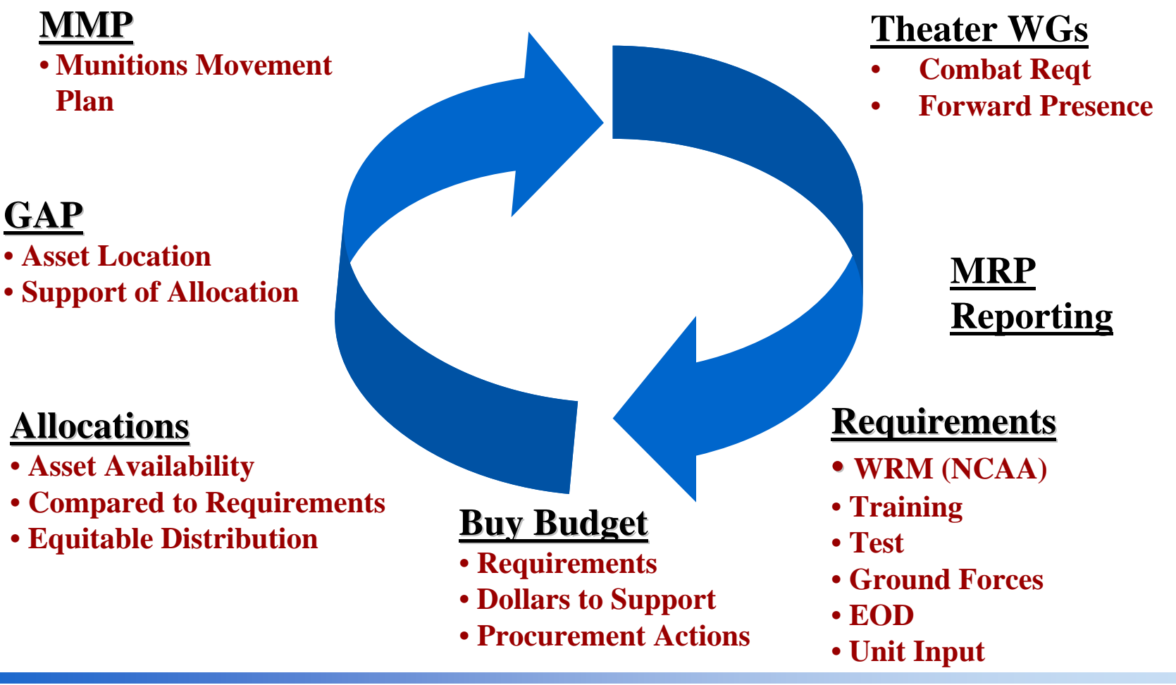
Start of the Annual Process