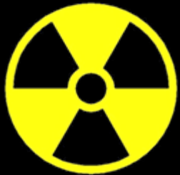
The Manhattan Project