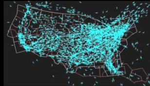
Air Traffic Control