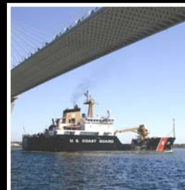
SafeNet LAN Replacement