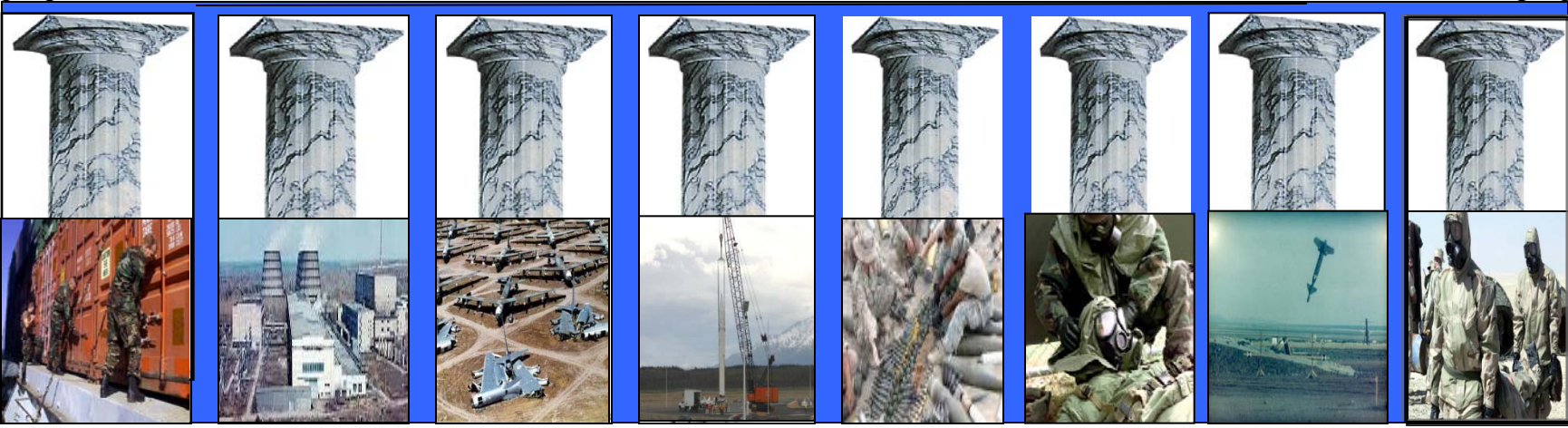
Threat Interdiction Reduction Cooperation