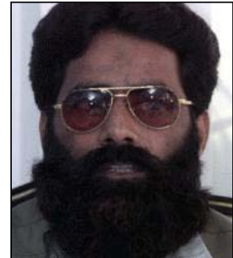
Ilyas Kashmiri allegedly plotted with a Chicago man against overseas targets.