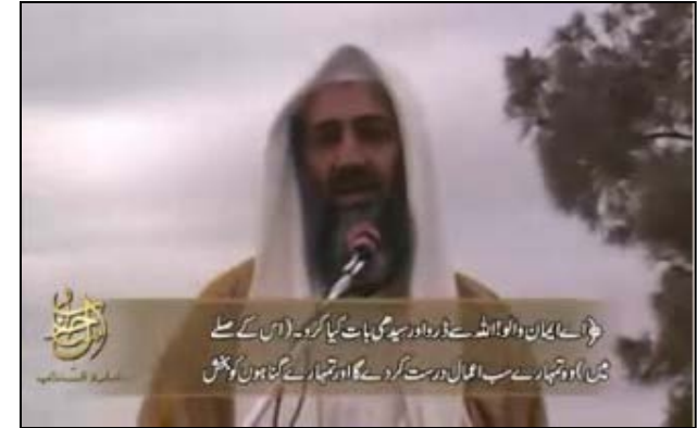
Usama Bin Laden in recent AQ video

— However, recent events suggest possible trend in which terrorists seek to conduct small, easy attacks