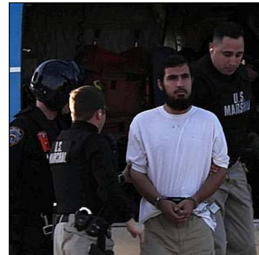
Najibullah Zazi allegedly planned to attack targets in the US with explosives.