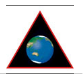
Pacific Disaster Center