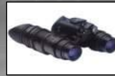
AN/PVS-15 Night Vision Goggle