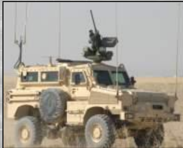
RG-31 Medium Mine Protected Vehicle