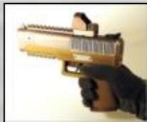
Handheld Laser Marker