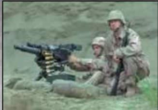
Advanced Lightweight Grenade Launcher