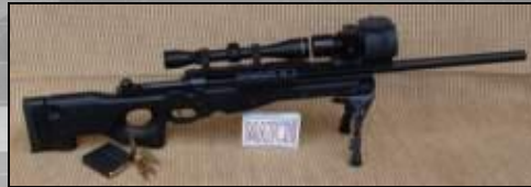
MK13 Sniper Rifle w/ INOD