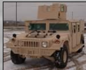
Ground Mobility Vehicle