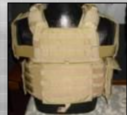
Body Armor/ Load Carriage System