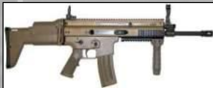
SOF Combat Assault Rifle