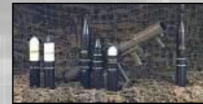
Multi-Purpose Anti-Armor Anti-Personnel Weapon System