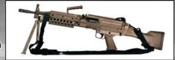
MK48 Lightweight SOF Machinegun