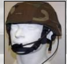
Modular Integrated Communications Helmet