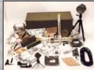
SOF Demolition Kit