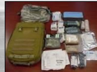
Combat Casualty Care Kit