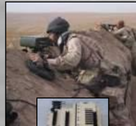
SOF Laser Acquisition Marker