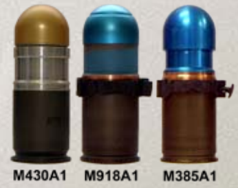
M430A1 M918A1 M385A1