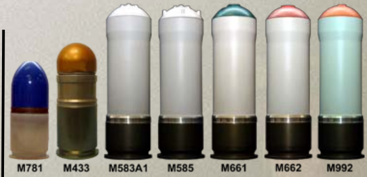
M781 M433 M583A1 M585 M661 M662 M992