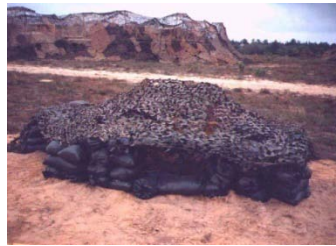
Lt. Fort. Pos/ Material