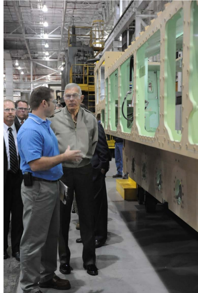
Gen Conway on the EFV assembly line in Lima, OH.

-James T. Conway, 34 th Commandant of the Marine Corps