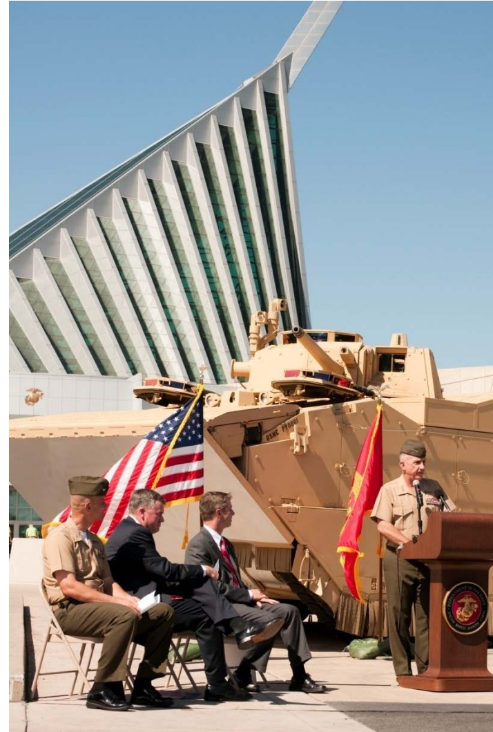
LtGen Flynn Speaking at the SDD-2 Roll Out Ceremony