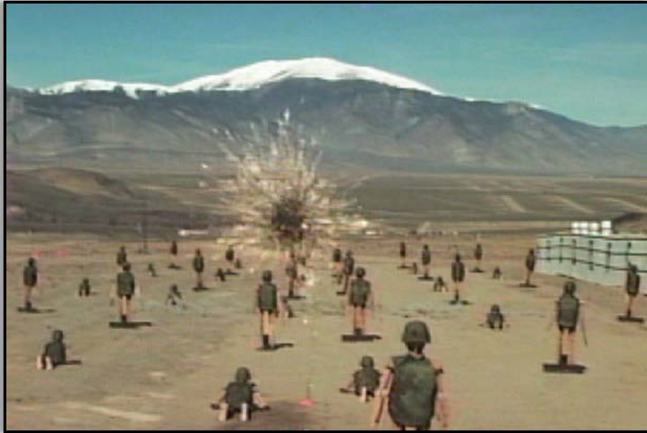
PABM round set on airburst detonating above an infantry target array.