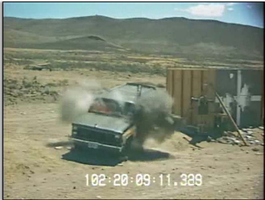
PABM round set on delay, penetrating and detonating inside a common urban target.