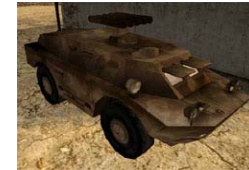
Lt Armored Vehicles