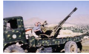
Unarm Veh/ Watercraft