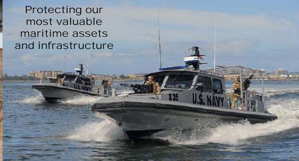
Protecting our most valuable maritime assets and infrastructure