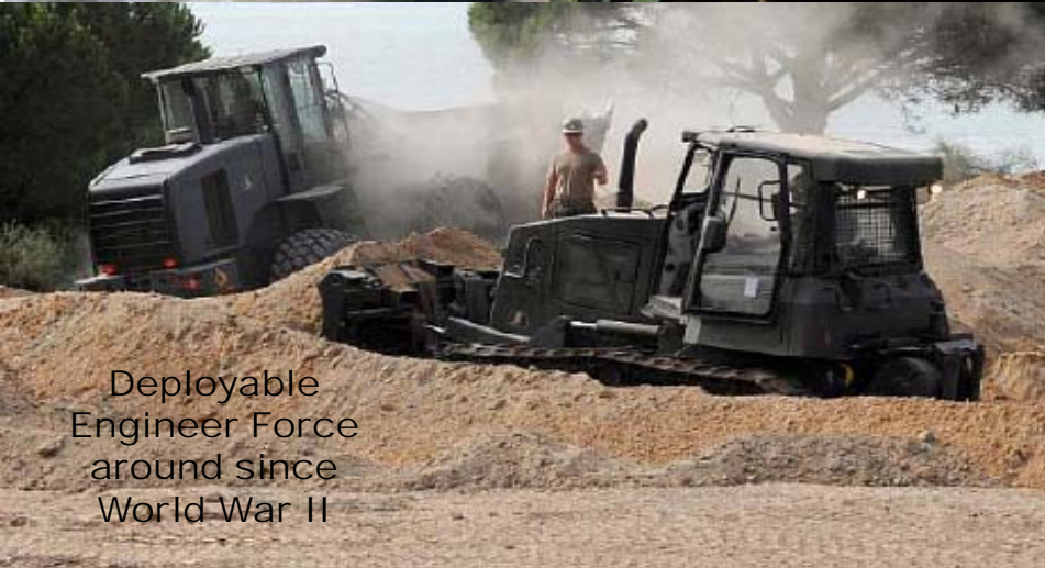
Deployable Engineer Force around since World War II