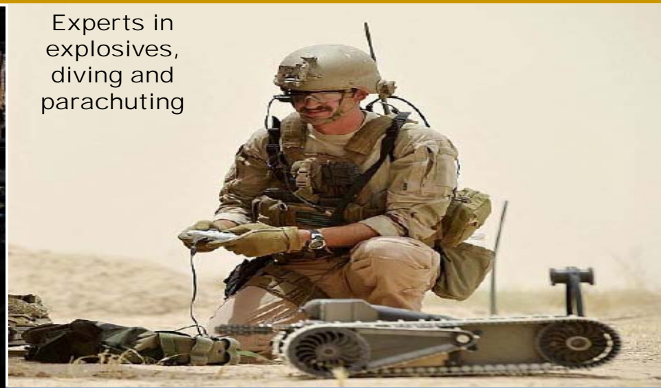
Experts in explosives, diving and parachuting