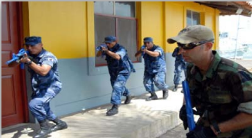
Maritime Civil Affairs/ Security Force Assistance Training