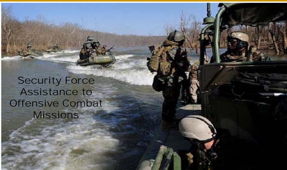
Security Force Assistance to Offensive Combat Missions