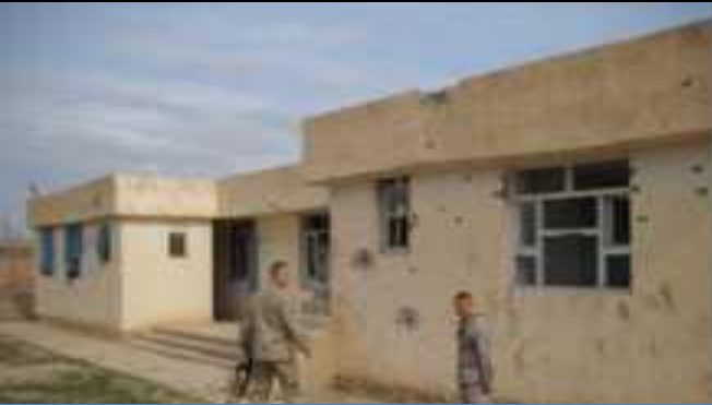
Post Taliban fall 2001 UN installs health clinic and water wells..