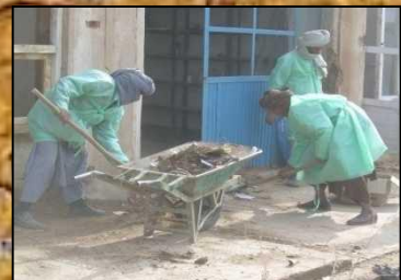
NZD Bazaar Clean Up