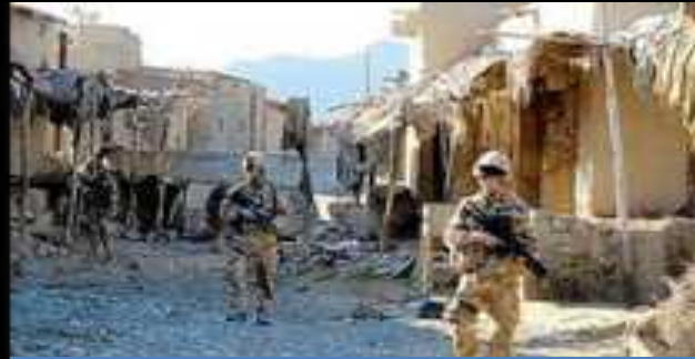
By 2007, fighting between Taliban and British, Gurkha and Estonian forces cause 30,000 residents to flee..