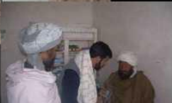
Licensed nurse and midwife offer medical services...