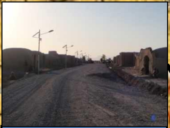
Rt 515 road project