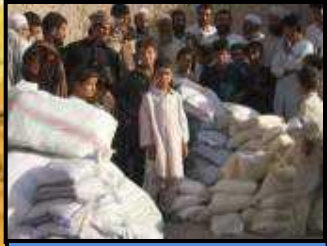
KSN -Wheat Distro