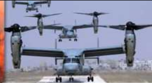
ACE: MAG-40 18 AH-1W/ 9 UH-1Y/ 12 CH53-E/ 10 CH-53D/ 4 C-130 / 10 AV-8B 2170 Personnel