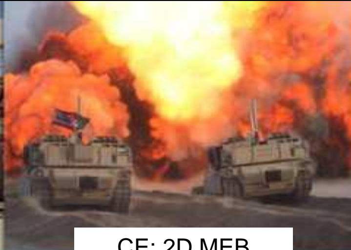
CE: 2D MEB 2102 Personnel