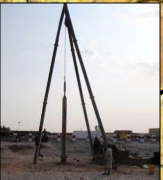
DLM Deep Water Well