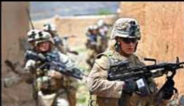
Marines from 2/7 replace Brits, followed by 3/8 then 3/4...