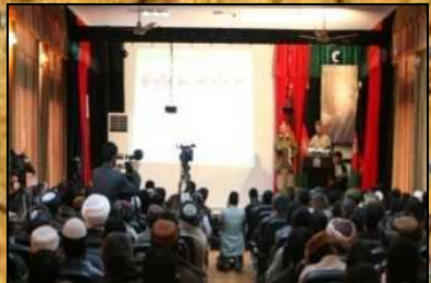
Afghan Business Conferences

STABILIZATION, DEVELOPMENT & ENGAGEMENT THROUGHOUT TFL GEO & POLITICAL AO