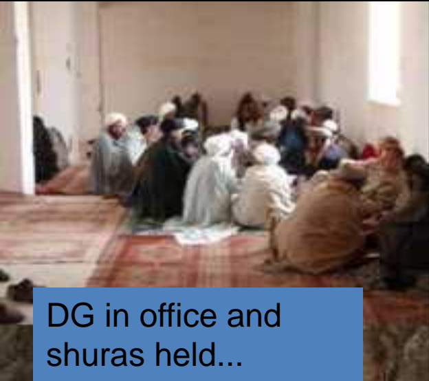
DG in office and shuras held...