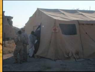
KSN - VMO