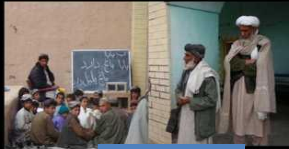
School in session...