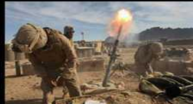
Dec 2009 MEB conducts Operation COBRA's ANGER to clear Taliban..