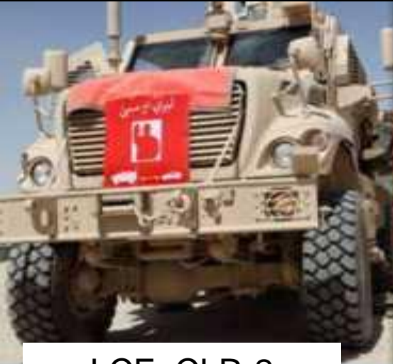
LCE: CLR-2 2232 Personnel