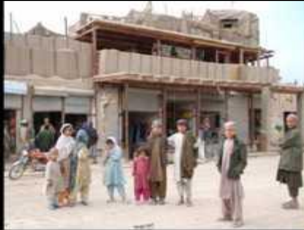
Over 40 Shops in bazaar...