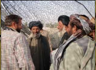
Nawa ASOP CC

STABILIZATION, DEVELOPMENT & ENGAGEMENT THROUGHOUT TFL GEO & POLITICAL AO