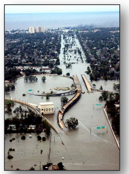
Hurricane Katrina Flooding