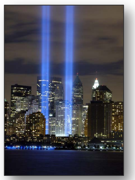
9/11 Terrorist Attacks