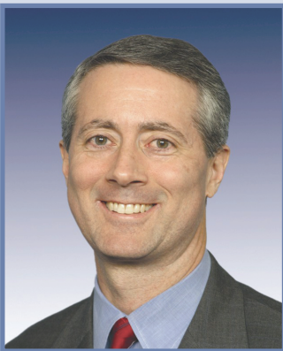
CONGRESSMAN MAC THORNBERRY Texas (R-13th District)