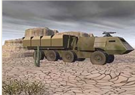
FTTS Cost = $XXX.XX ea