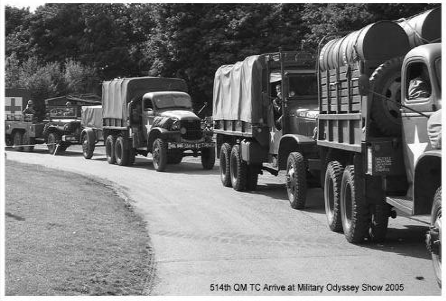
1945 CCKW Cost = $10,000 ea

.....but because of advances; in the future not just anyone can operate the truck. 6