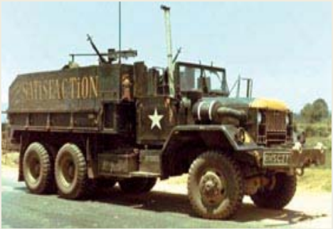
1959 M35 Cost = $15,000 ea

Driver Assisted Features (Pwr Steering & Air Brakes)