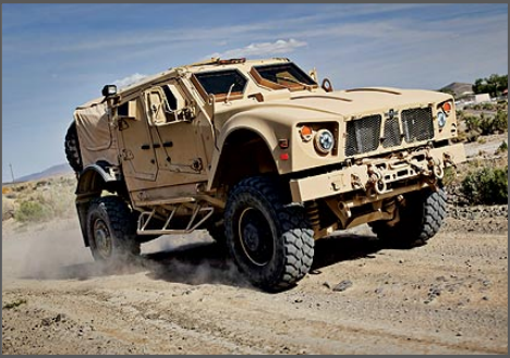
M-ATV Cost = Over $400,000 ea

Driver Assisted Features (Pwr Steering & Air Brakes)