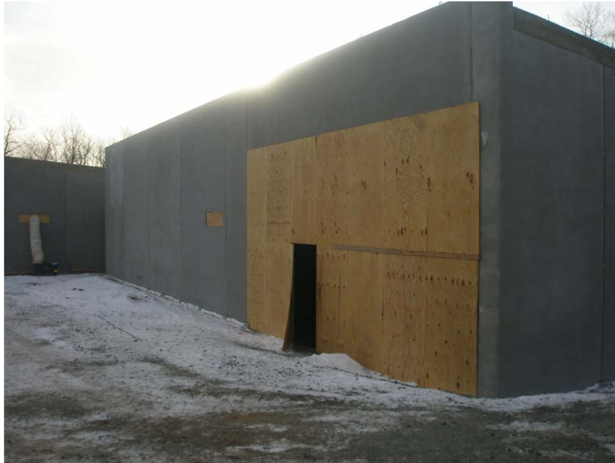
Firing Bay and Control Room