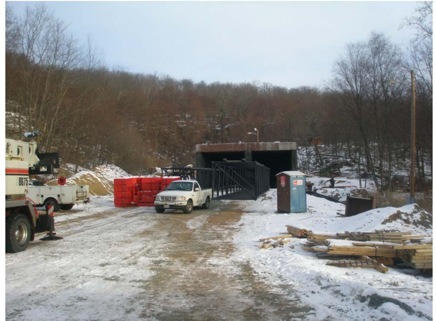
Dual Slug Butts