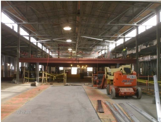
Tech Data Center B61