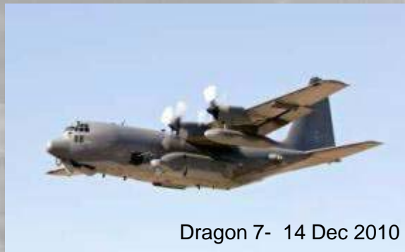
Dragon 7- 14 Dec 2010