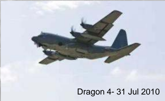
Dragon 4- 31 Jul 2010