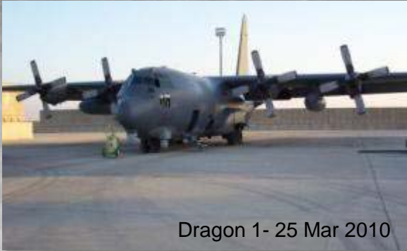
Dragon 1- 25 Mar 2010