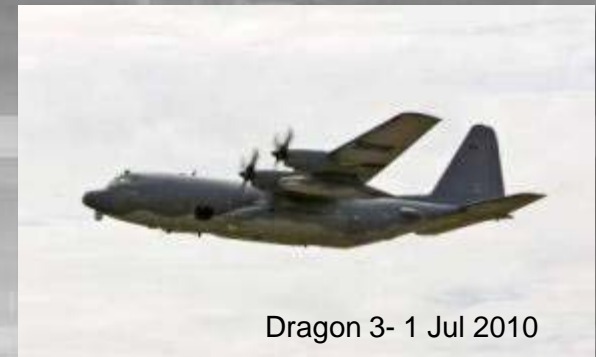
Dragon 3- 1 Jul 2010