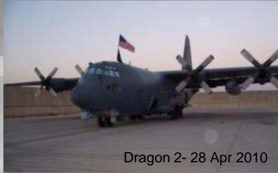
Dragon 2- 28 Apr 2010