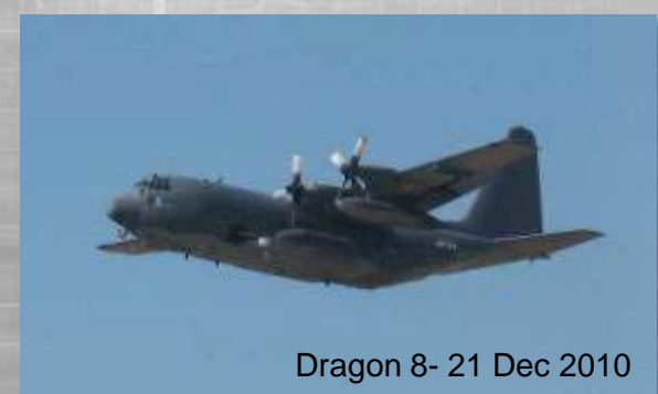
Dragon 8- 21 Dec 2010