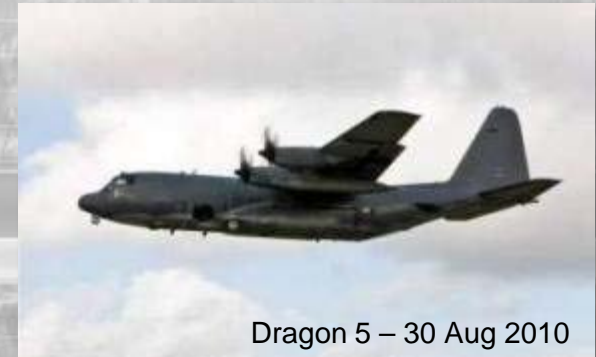
Dragon 5 - 30 Aug 2010