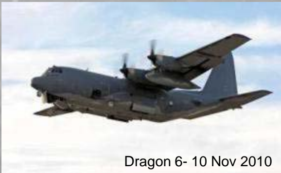
Dragon 6- 10 Nov 2010