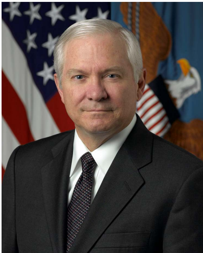
The Honorable Dr. Robert M. Gates, 22 nd Secretary of Defense, interview at The American Enterprise Institute, carried on CSPAN, 24 May 2011

...our record of predicting where we will use military force since Vietnam is perfect. We have never once gotten it right.