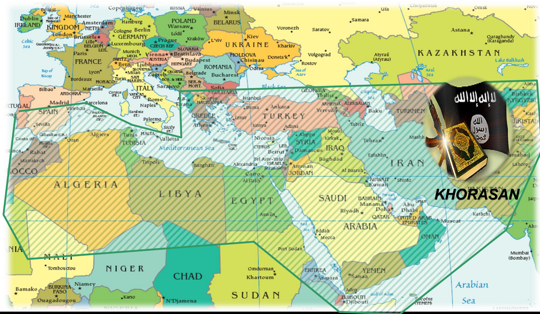
THE ISLAMIC CALIPHATE – SHADING SHOWS APPROXIMATE EXTENT