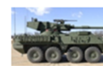
Mobile Gun System