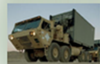
Load Handling System