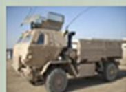
FMTV 2.5-Ton Cargo