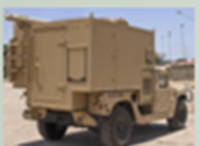
HMMWV Shelter Carrier