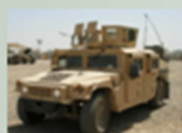
HMMWV Armament Carrier