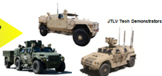
JLTV Tech Demonstrators

Restore Balance Between Payload, Performance & Protection