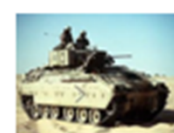
Bradley Fighting Vehicle