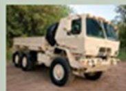
FMTV 5-Ton Cargo