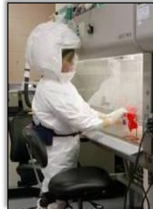
Scientist working in an ECBC Biological Safety Level 3 Lab

Working safely with chemical and biological agents in research, engineering and operations for the DoD and nation