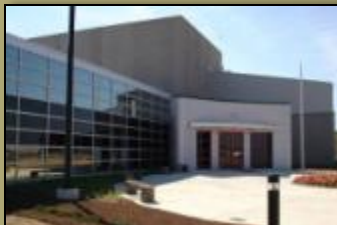
Advanced Chemistry Laboratory