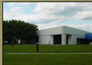
Berger Engineering Complex