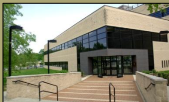
McNamara Life Sciences Bldg.