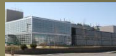
Sample Receipt Facility