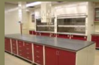
Phase II of ACL – Third Wing