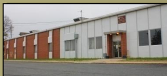
Forensic Analytical Center