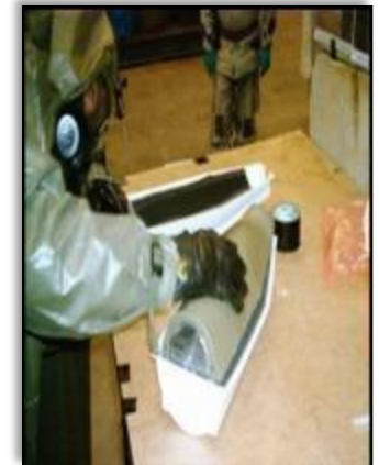
ECBC operators in chemical demil facility