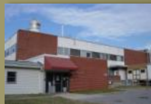
Aerosol Test Facilities