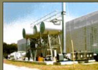
Single Small-Scale Facility