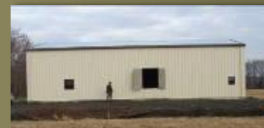
Standoff Detection Technology Evaluation Facility