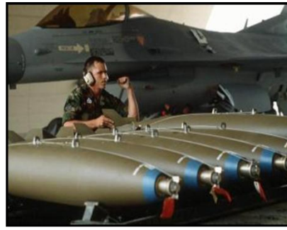
Additional MDS A/C