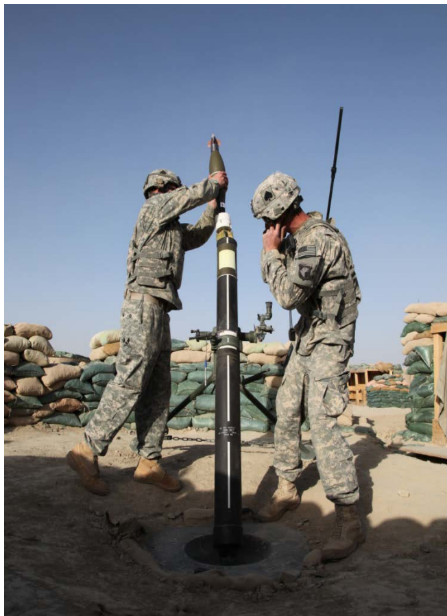
1 st XM395 Cartridge Shot in OEF (Training) 1 st Battalion, 506 th Infantry Regiment, 4 th Brigade Combat Team, 101 st Airborne Division 26 March 2011