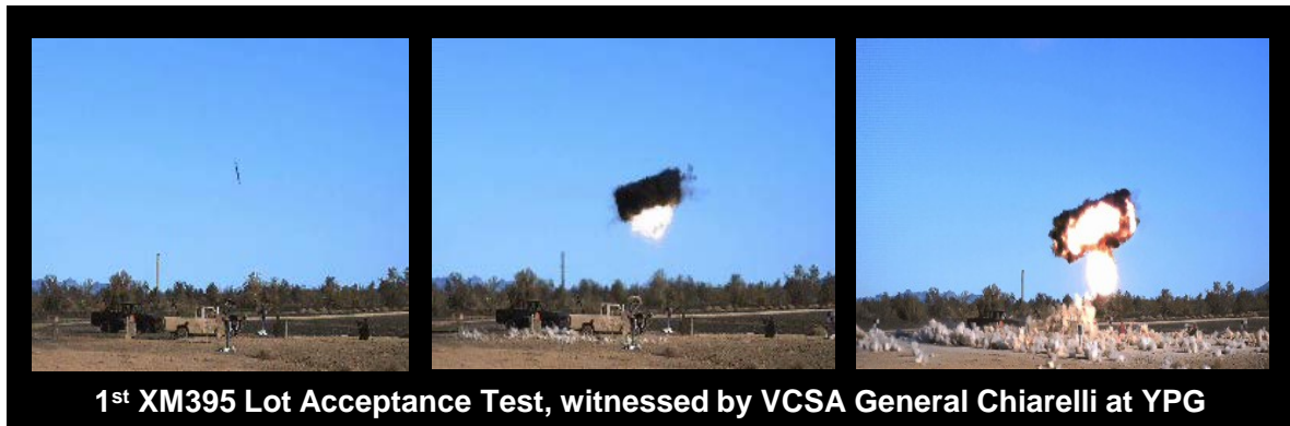
1 st XM395 Lot Acceptance Test, witnessed by VCSA General Chiarelli at YPG