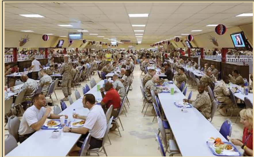
KANDAHAR AIRFIELD BASE, AFGHANISTAN

NAMSA provide 4 DFACS, each styled to appeal to different national and cultural aspects of the ISAF personnel at KAF