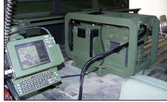
M111 Improved Position and Azimuth Determining System (IPADS)