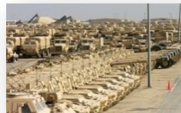
Army Prepositioned Stocks (APS)