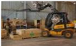
Lead Materiel Integrator