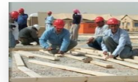
Logistics Civil Augmentation Program (LOGCAP)