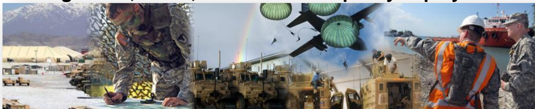
Contingency Operations in Southwest Asia and posturing for the Pacific