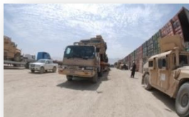
Materiel Management: Distribution & Readiness