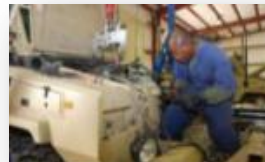
Directorate of Logistics