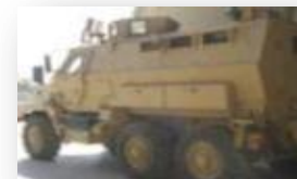
Army Force Generation (ARFORGEN)