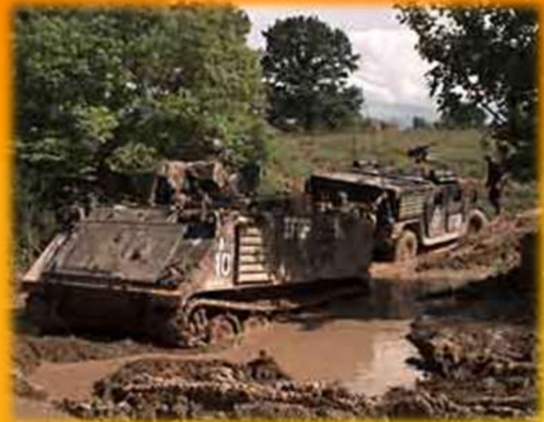
M113 Recovers HMMWV, Bosnia, 1996