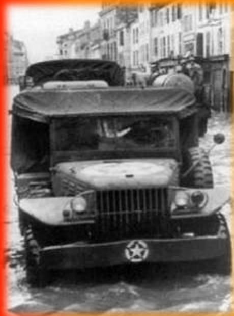
3/4-ton Dodge w/o Winch 1944