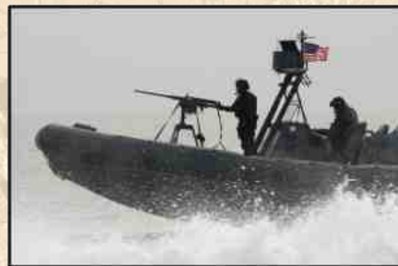
CREST: NSWCC Peak Health And Performance (FY12-14)