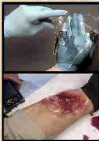
SEAL SKIN: Hemorrhage Control Dressing (FY12-13)