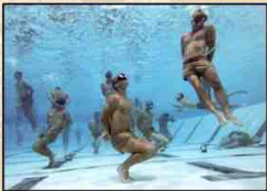
HAMMERHEAD: Underwater Medical Monitoring (FY12-13)