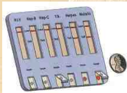
Blood Donor Pathogen Kit (FY12-13)