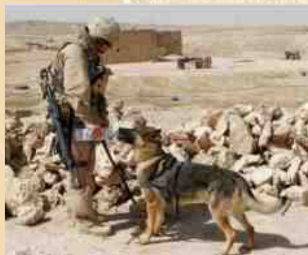
Canine Hydration Optimization (FY12-13)