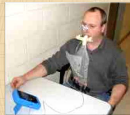
Respiratory Muscle Training for Performance at Altitude (FY12-13)