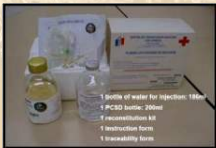
Freeze Dried Plasma