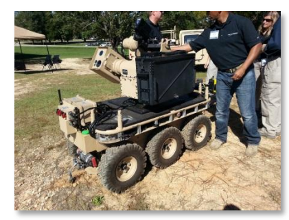
Northrop Grumman's CaMEL