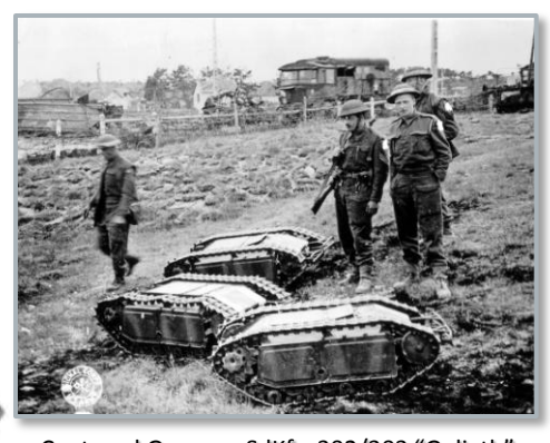
Captured German SdKfz. 302/303 "Goliath"