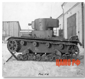
Soviet TT-2 Teletank