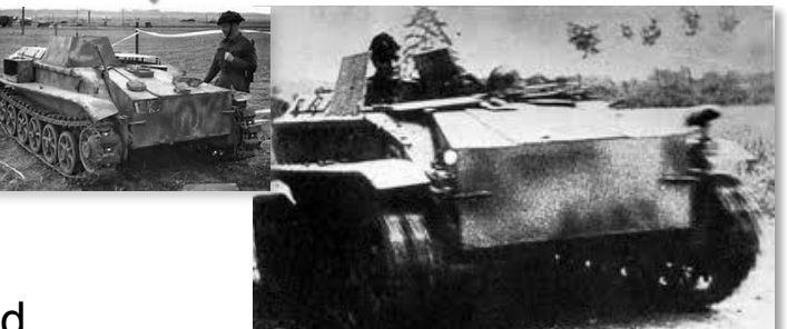
SdKfz. 301 "Borgward IV"