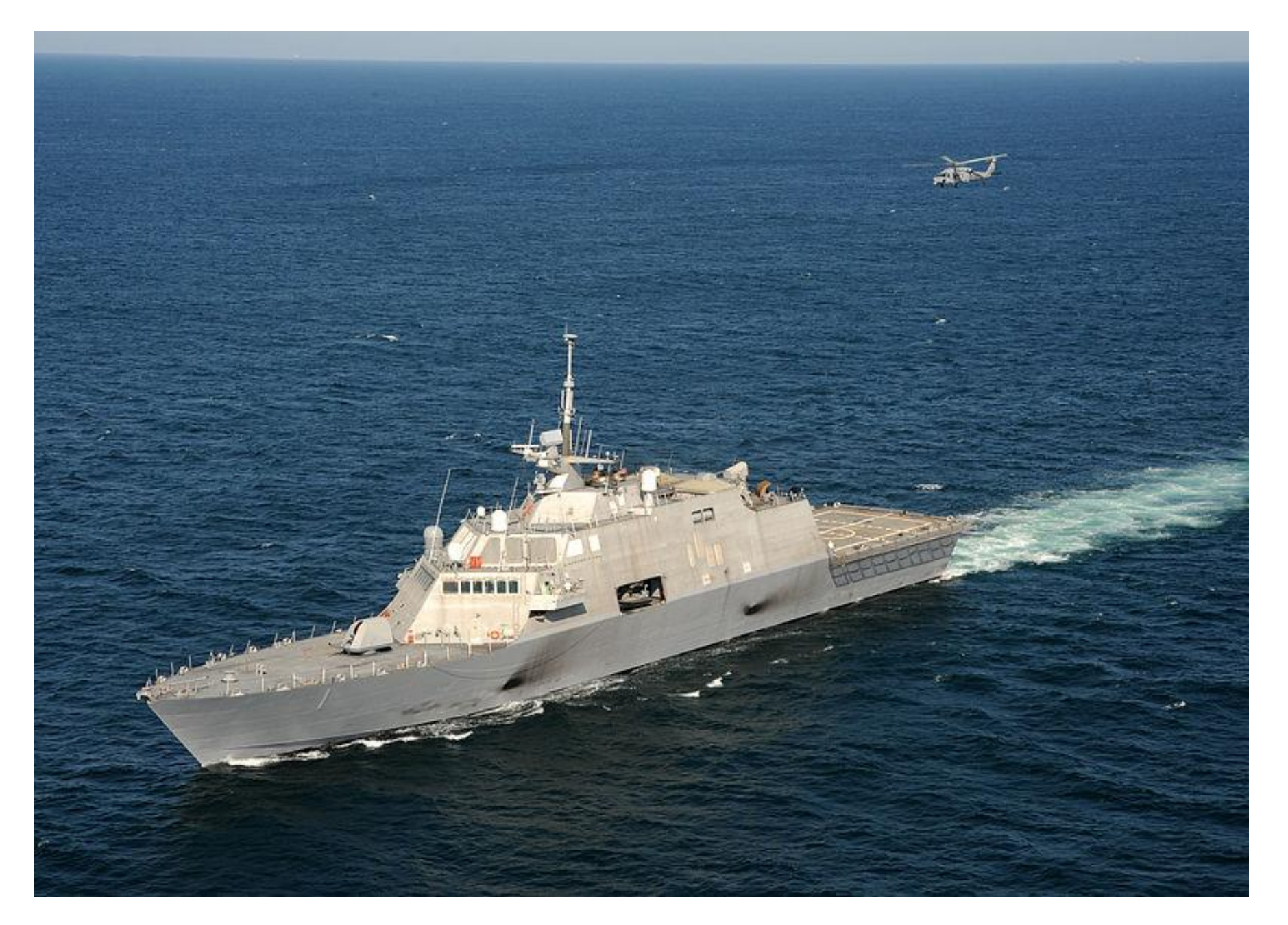
USS FREEDOM LCS 1