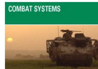
Land and expeditionary combat vehicles and systems, armaments and munitions