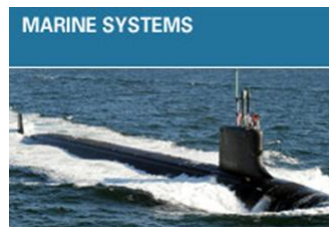
Shipbuilding and marine systems