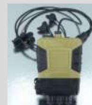
Silynx Headset (except AFSOC)