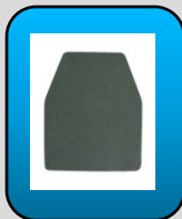
Stand-Alone Swimmer GEN IV Plate