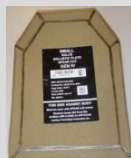
GEN IV Plate