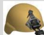
Wilcox Helmet Mount