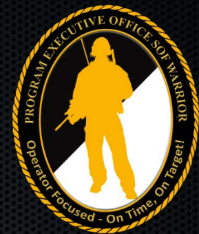
Mobility - GMV Roadmap