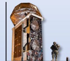
Small Space – Access to the Internet