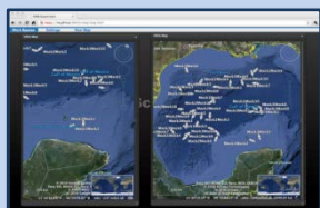
Virtual Integrated Domain Awareness (Evolved Into CSII)