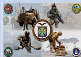
Counter – Improvised Explosive Device