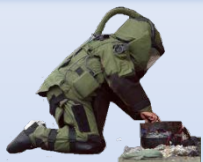
Counter Bomb/ Counter Bomber