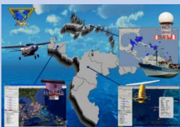
Regional Domain Awareness