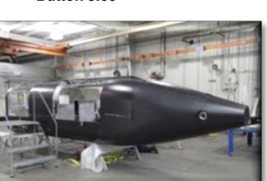
Shallow Water Combat Submersible