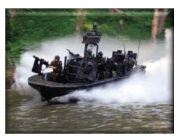
Special Operations Craft - Riverine