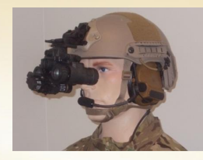
Night Vision Goggle w/ Clip-on Thermal Imager