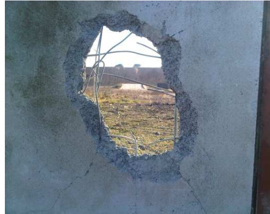
Shot 2 : 76 cm (H); 100 cm (V)