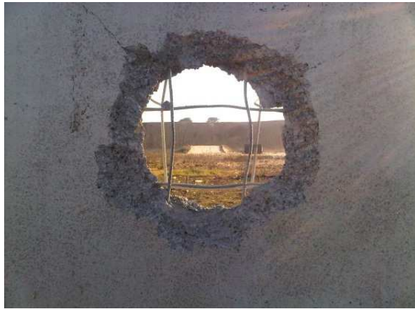
Shot 1 : 50 cm

Target compliant with ITOP 5-2-503 Double reinforced concrete wall