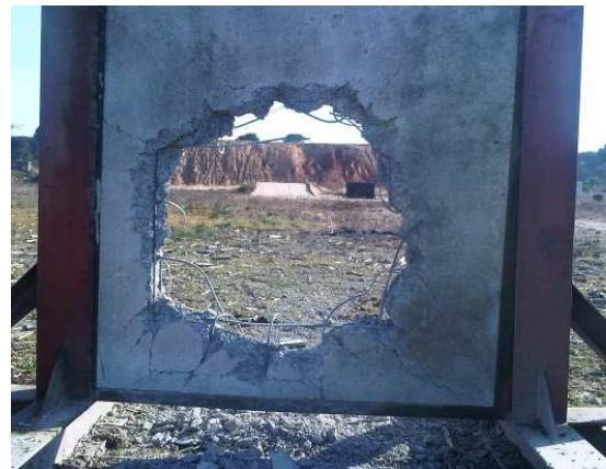
Shot 4 : 135 cm (H); 125 cm (V)