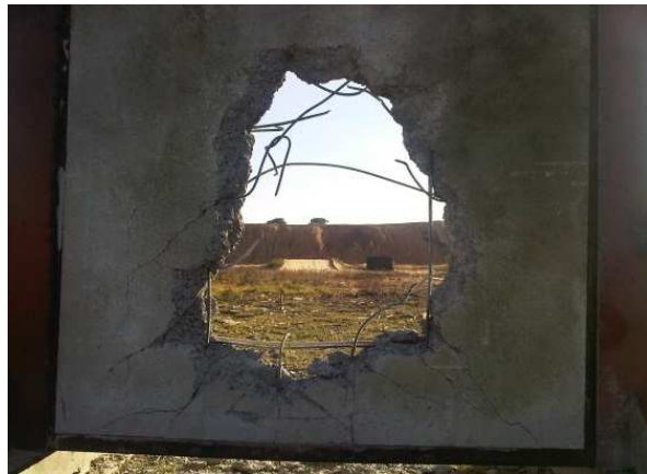
Shot 3 : 87 cm (H); 120 cm (V)