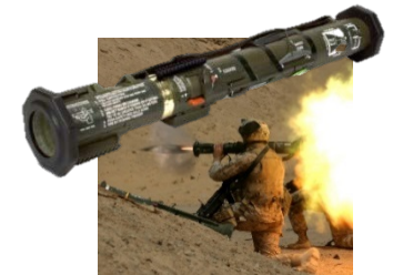
AT4 & AT4CS