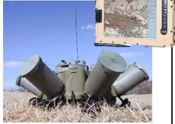
Spider Inc 1a