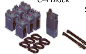
RF-Remote Activation System (RAMS)