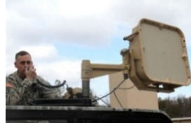
Acoustic Hailing Device