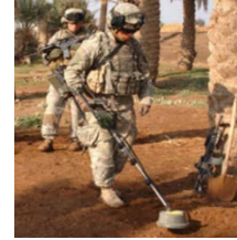
AN/PSS-14C Hand Held Mine Detectors