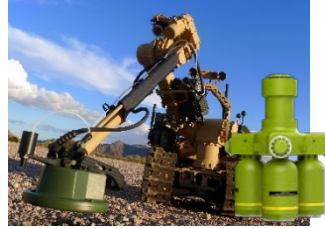
Autonomous Mine Detection System (AMDS)