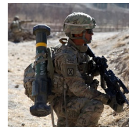
Bunker Defeat Munition