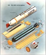
GATOR Landmine Replacement