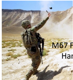
M67 Fragmentation Hand Grenade