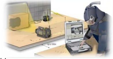
Explosive Ordnance Disposal