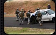
Vehicle Interdiction Training