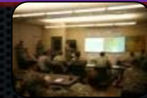
Exercise Management Control