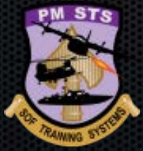
PM SOF Training Systems Integration and Sustainment