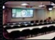
Mission Rehearsal Operations Center