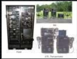
Radio Integration System