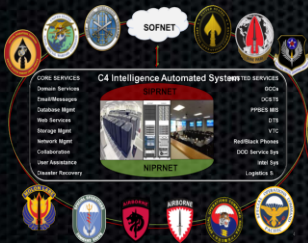
C4 and Intelligence Automation Systems / Special Operations Command Research, Analysis, and Threat Evaluation System