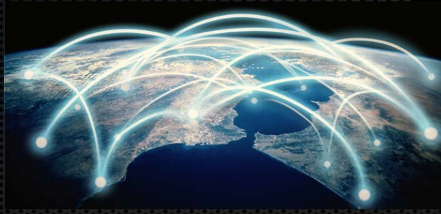
SCAMPI (not an acronym)