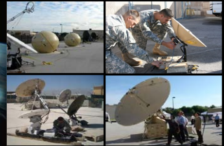
SOF Deployable Nodes / Mobile SOF Strategic Entry Point