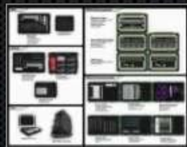
Tactical Local Area Network