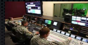
Media Production Center