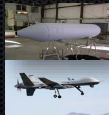
Long Range Broadcast System