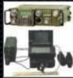
SOF Tactical Communications